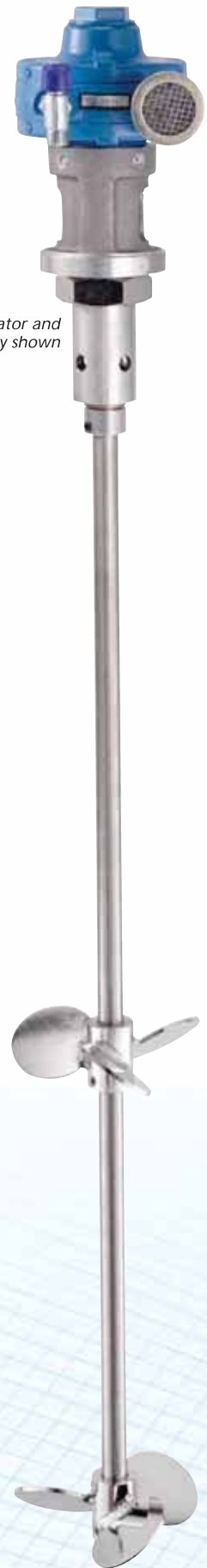
41-3300 agitator and drive assembly shown

An air filter and moisture trap is recommended.